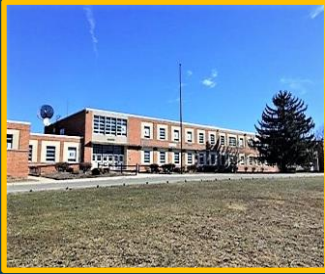
Fort Chiswell High School