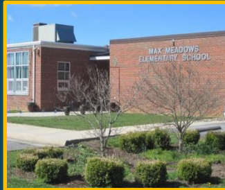
Max Meadows Elementary School