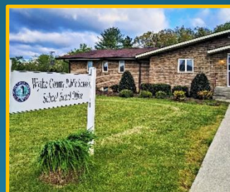
Wythe County School Board Office