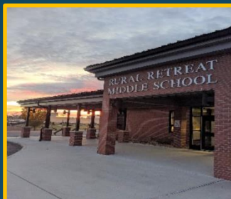
Rural Retreat Middle School