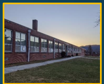
Scott Memorial Middle School