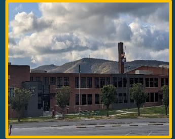
George Wythe High School