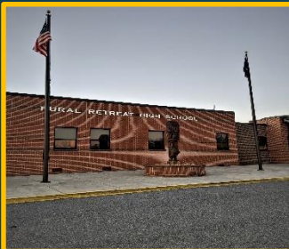
Rural Retreat High School