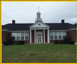
Jackson Memorial Elementary School