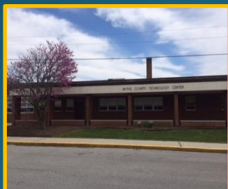
Wythe County Technology Center