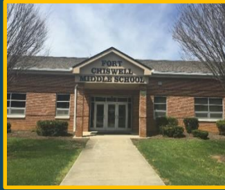
Fort Chiswell Middle School