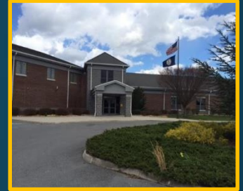
Rural Retreat Elementary School