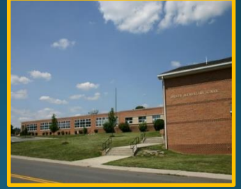
Spiller Elementary School