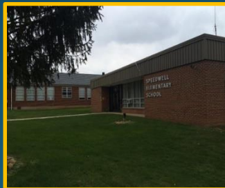
Speedwell Elementary School