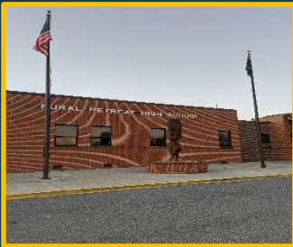
Rural Retreat High School