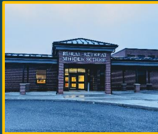
Rural Retreat Middle School