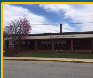
Wythe County Technology Center