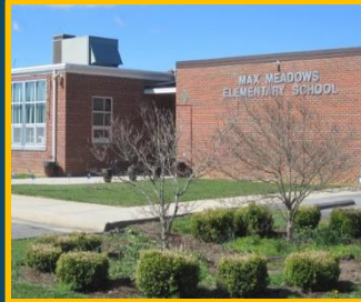
Max Meadows Elementary School