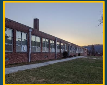
Scott Memorial Middle School