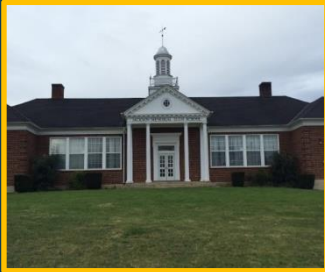
Jackson Memorial Elementary School