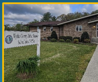
Wythe County School Board Office