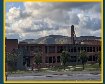
George Wythe High School