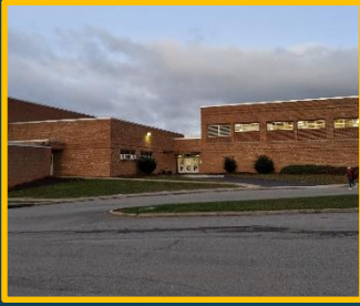
Fort Chiswell High School