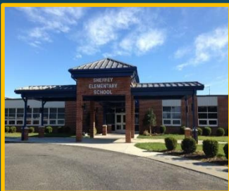
Sheffey Elementary School