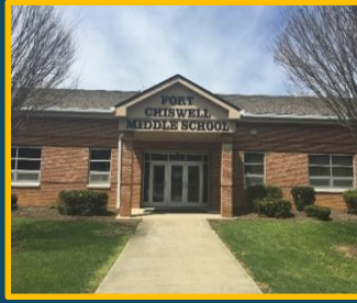
Fort Chiswell Middle School